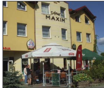
Hotel Maxim, Zywiec

J OIN us on Shoreham Society's third summer trip to Krakow & Zywiec : only £390 for nine days. The riverside town of Zywiec is Shoreham's 'Twin Town' in southern Poland with a huge brewery, a large lake and an international folk festival. It's close to some world heritage sights which we'll visit: the Salt Mines at Wieliczka, Wadowice, Auschwitz and of course Krakow, where we stay for three nights. We'll visit the Tyskie brewery and some microbreweries too but it's not all beer because we can enjoy the local food, the customs, history and culture with free entertainment each evening in Zywiec at The 47th Festival of Polish Highlanders' Folklore ( www.tkb.art.pl ) held in the park amphitheatre and Castle courtyard. The climate is mild and pleasant.