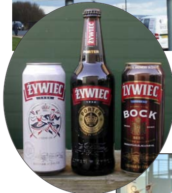
Left: Zywiec products. Right: Oswiecim. Below: Folk dance. Bottom right: area map